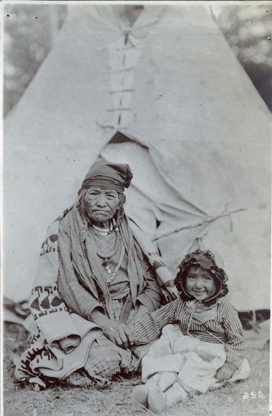
The "Old and New" Stony Indian 1860ft.